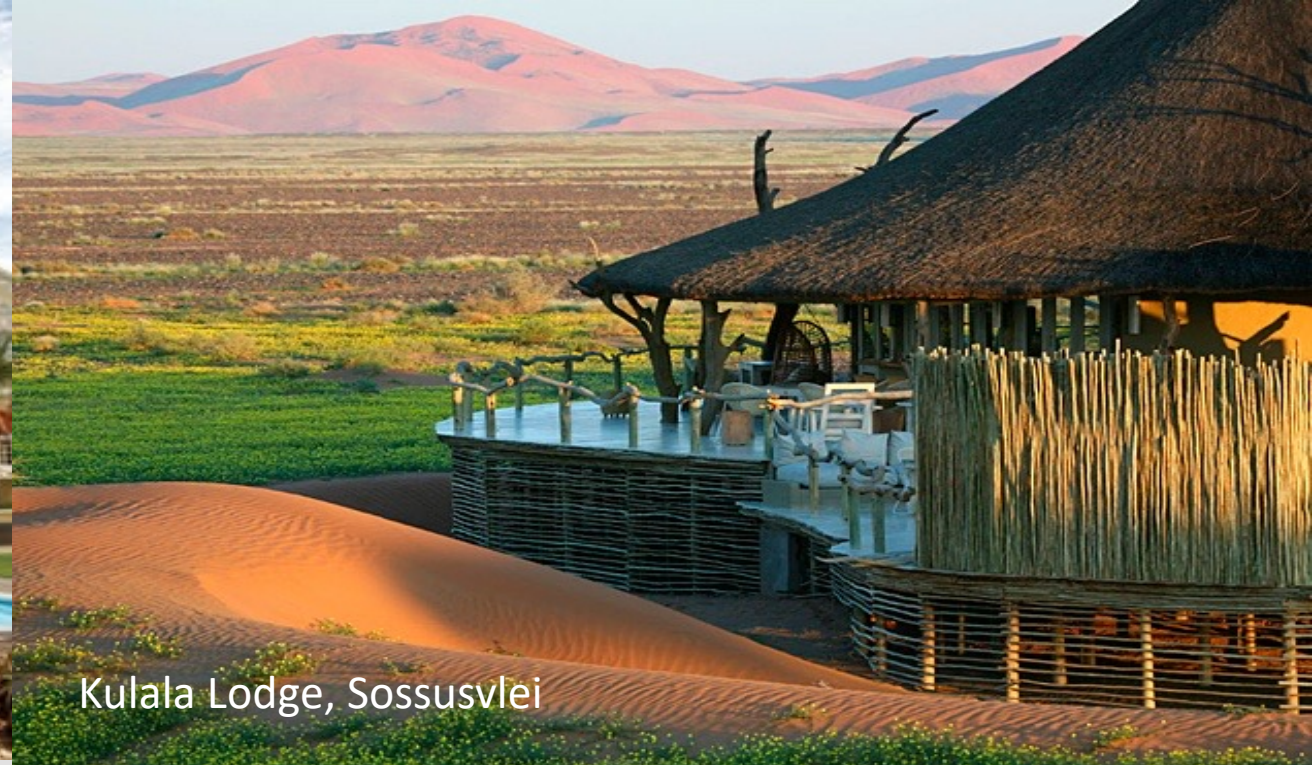
Kulala Lodge, Sossusvlei