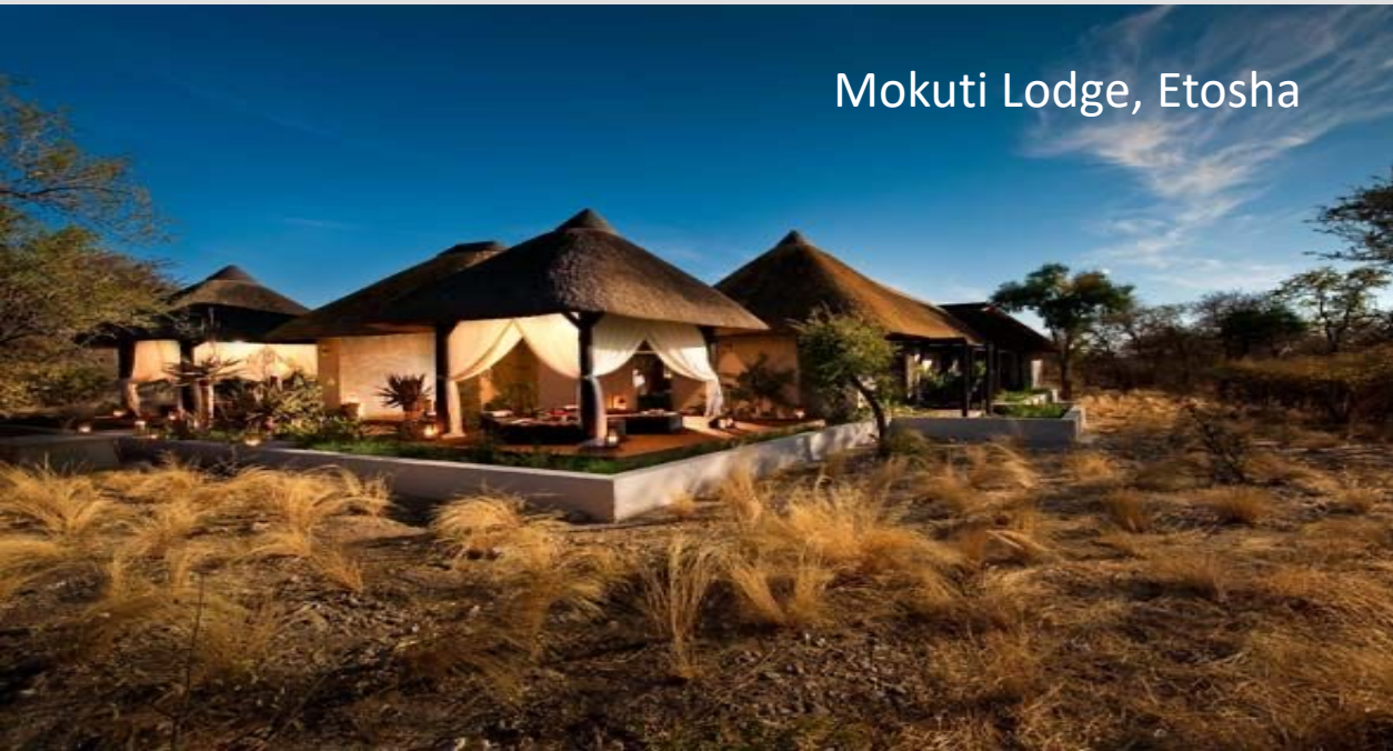
Mokuti Lodge, Etosha