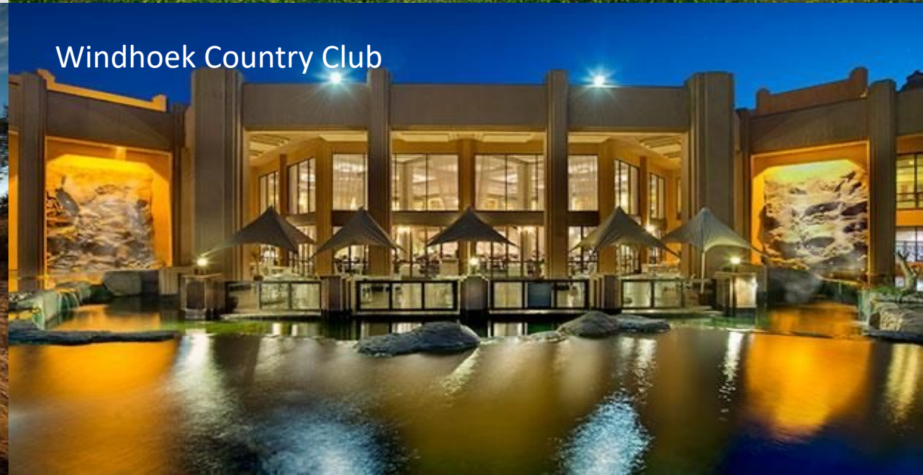
Windhoek Country Club