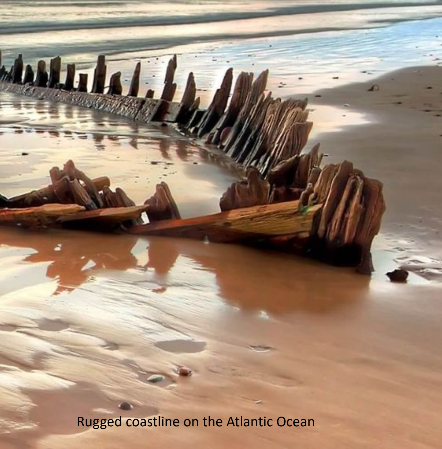
Rugged coastline on the Atlantic Ocean