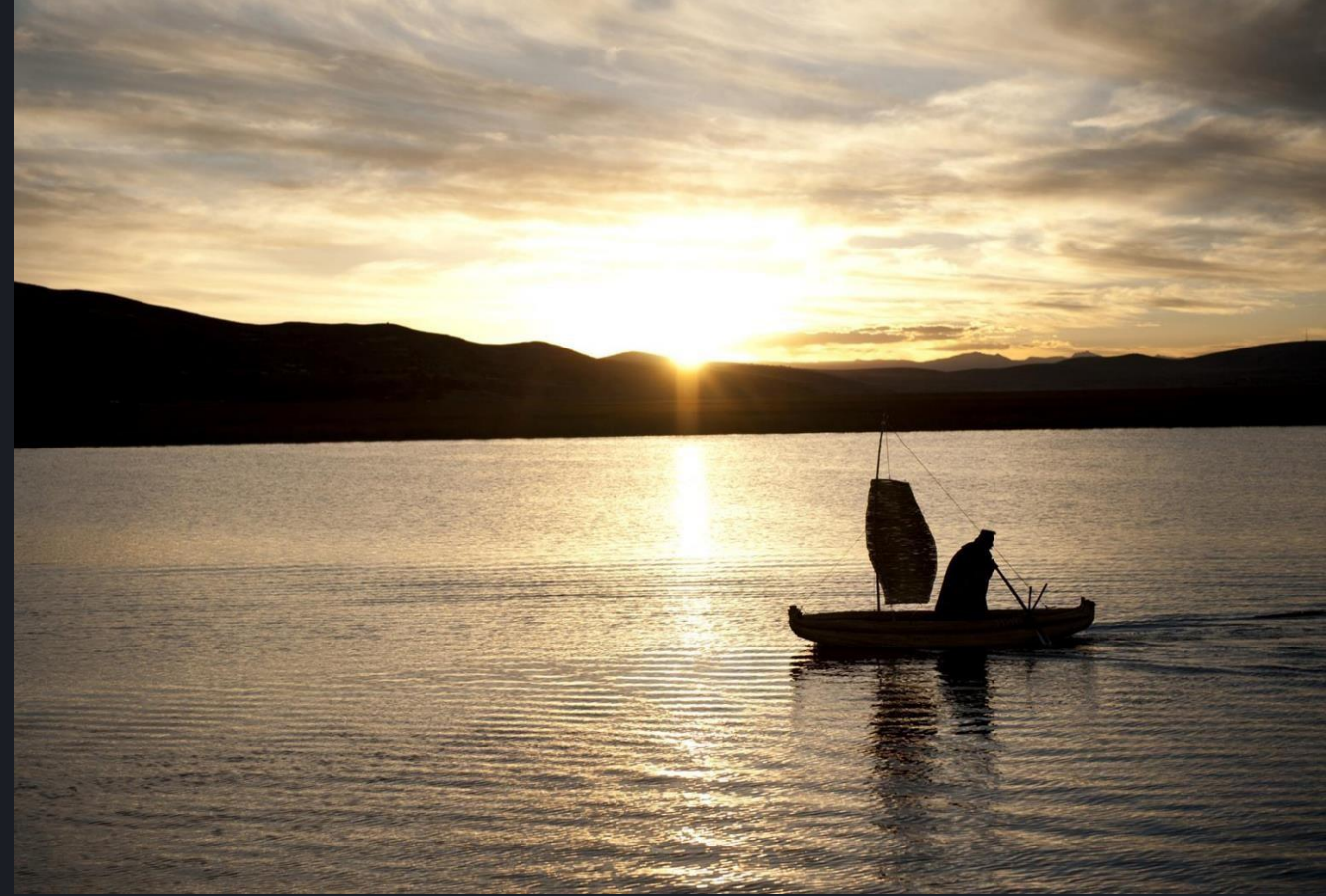
TIAHUANACO (Puno) 600 a 1000 BC 386 Km South East from Cusco