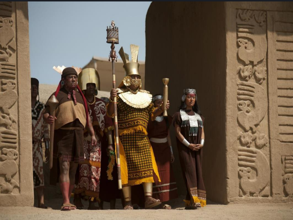
CHIMÚ (Trujillo) 100 a 1470 AD 560 Km North from Lima