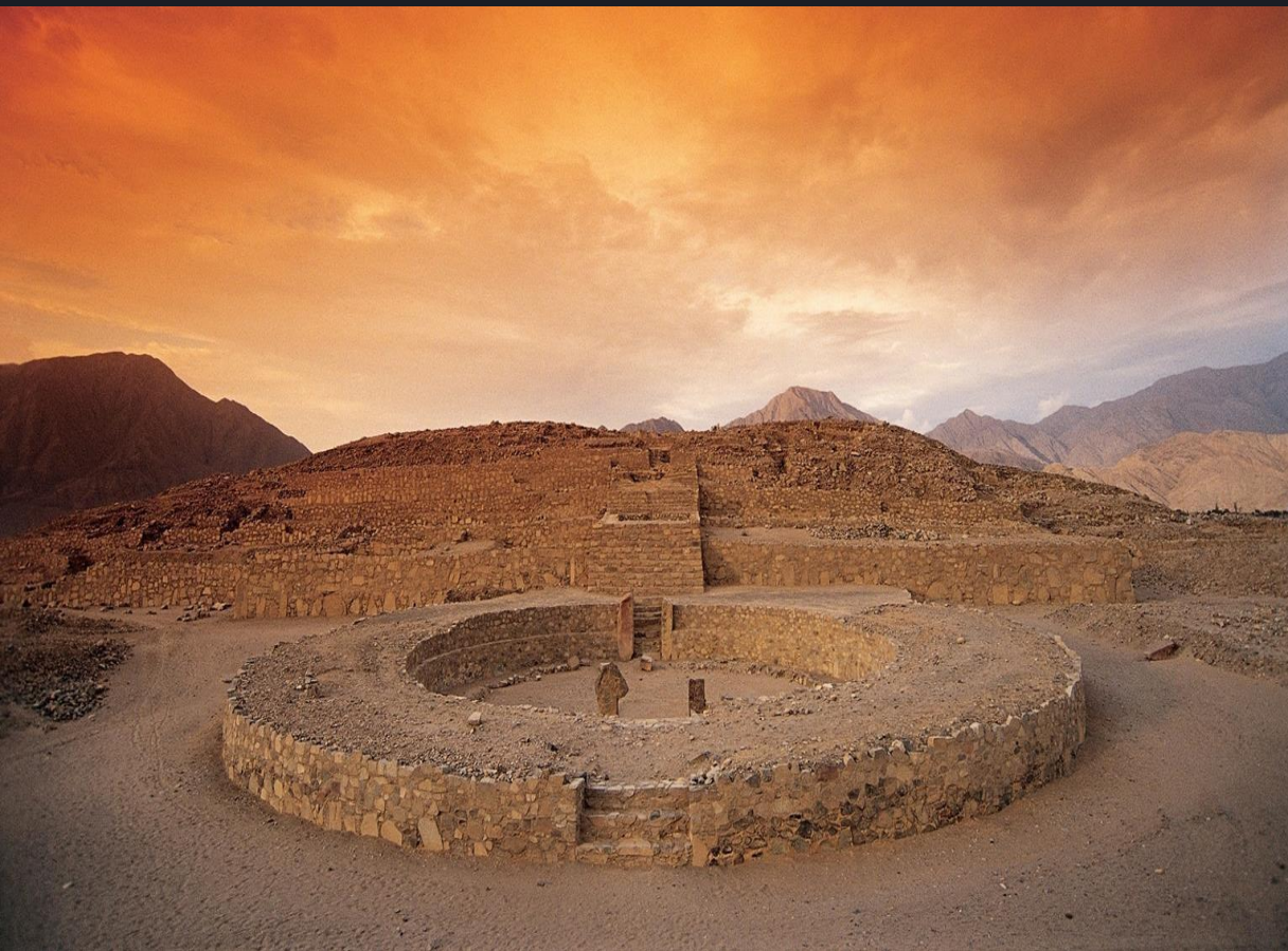
CARAL (Lima) 3000 a 2500 BC 200 km North from Lima