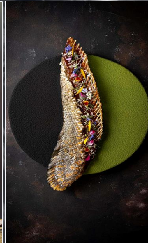
CHEF'S TABLES & COOKING CLASSES