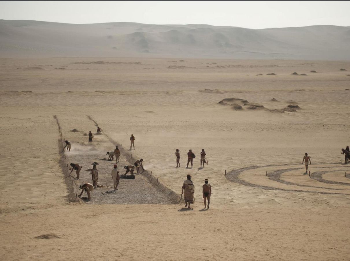
NASCA (Ica) 200 BC a 700 AD 142 Km South from Lima