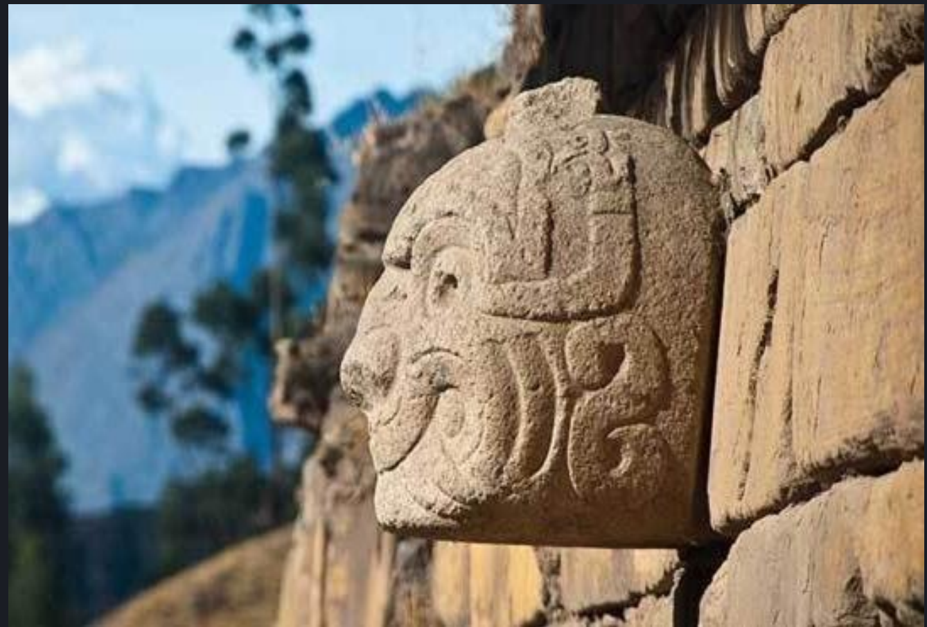
CHAVÍN (Ancash) 1200 a 400 BC 400 km North from Lima