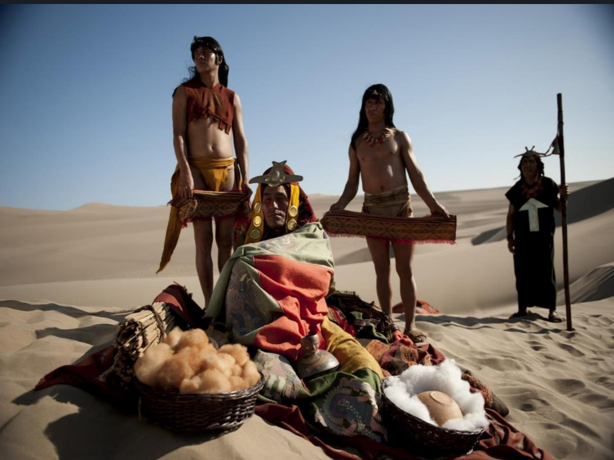
PARACAS (Ica) 900 BC a 200 AD 76 Km South from Lima