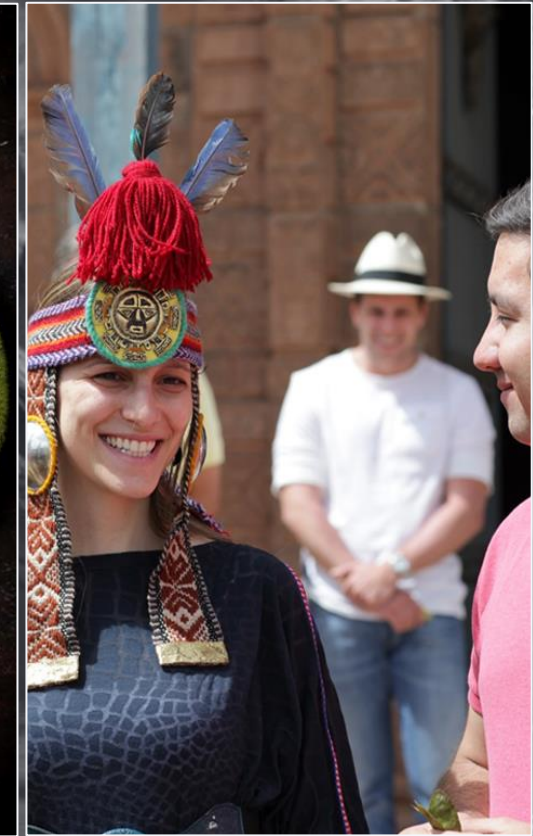
HONEY MOON CELEBRATIONS