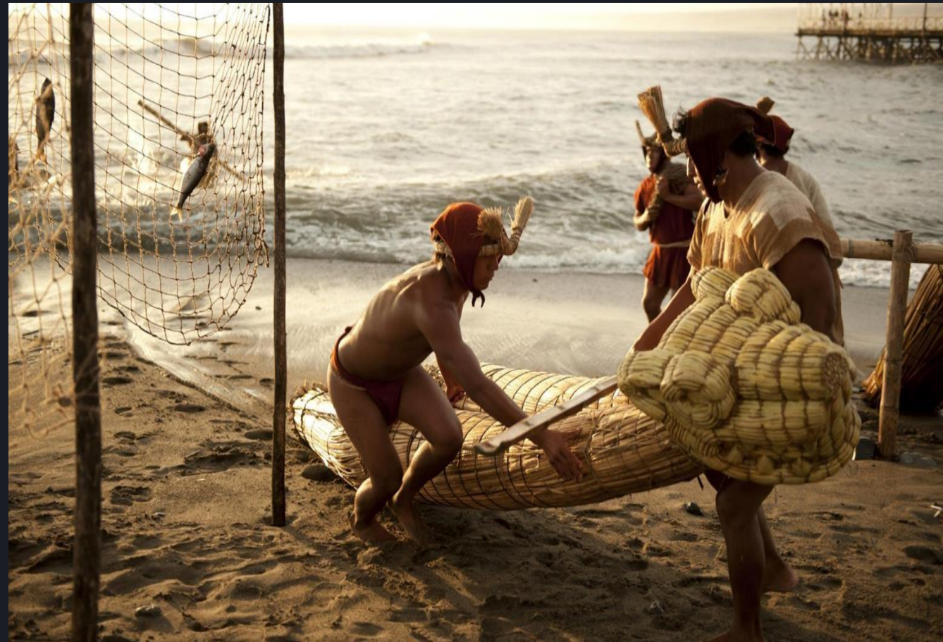
MOCHICA (Lambayeque) 100 BC a 800 AD 560 Km North from Lima