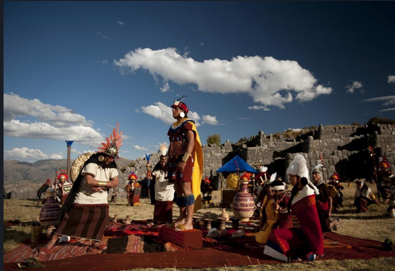
INCA CULTURE 1400 to 1532 AD